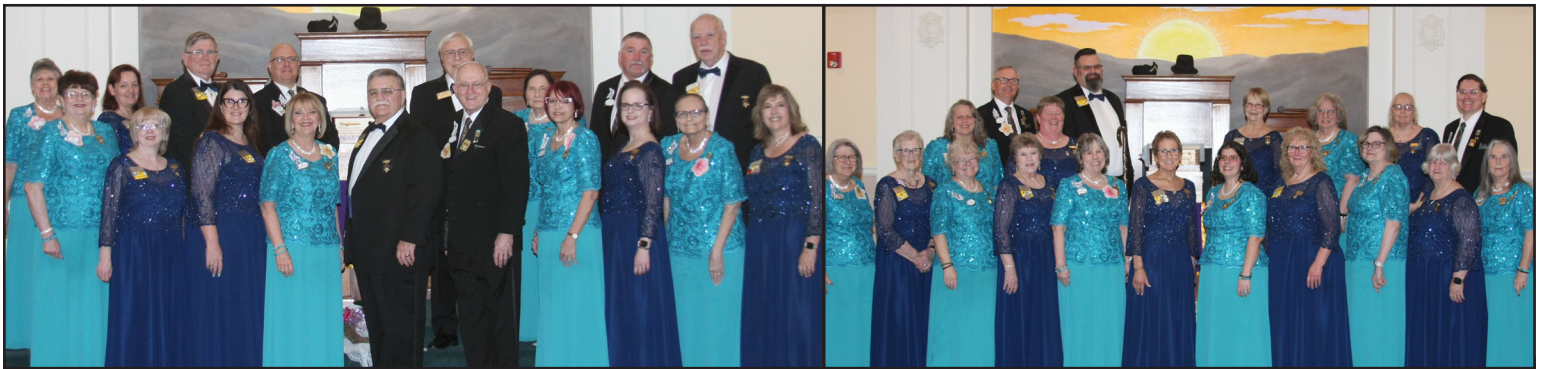
The Elective and Appointive Grand Officers of Kansas and Oklahoma