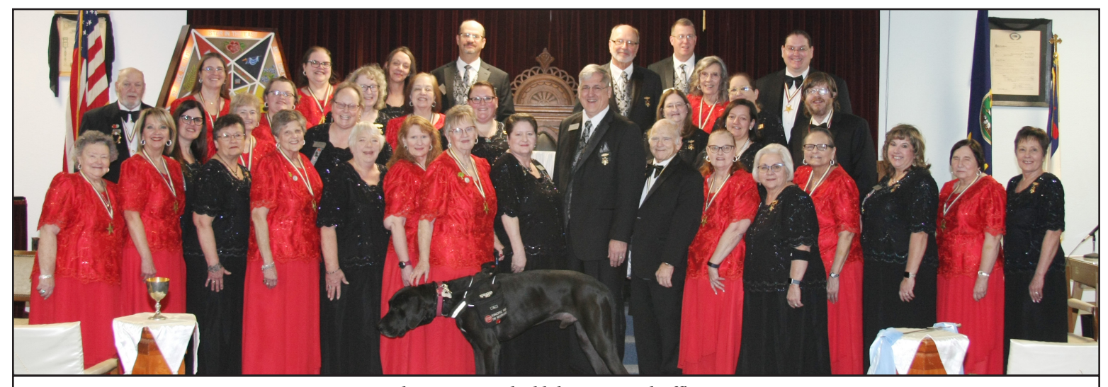
The Kansas and Oklahoma Grand Officers

The Kansas/Oklahoma Exchange was held January 27th and 28th in Liberal, Kansas. We had 96 reservations with 93 attending.