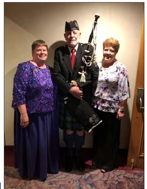
Family and new friends get together before the evening festivities in New Brunswick, Canada.