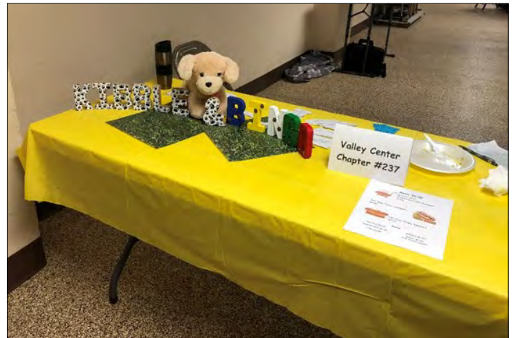
Boaz was ready to greet everyone as they came to enjoy dogs and bingo! He was excited about the amount that was raised to help Service Dogs and wants to thank everyone who donated prize money back to help service dogs!

The first person to win the blackout prize was a