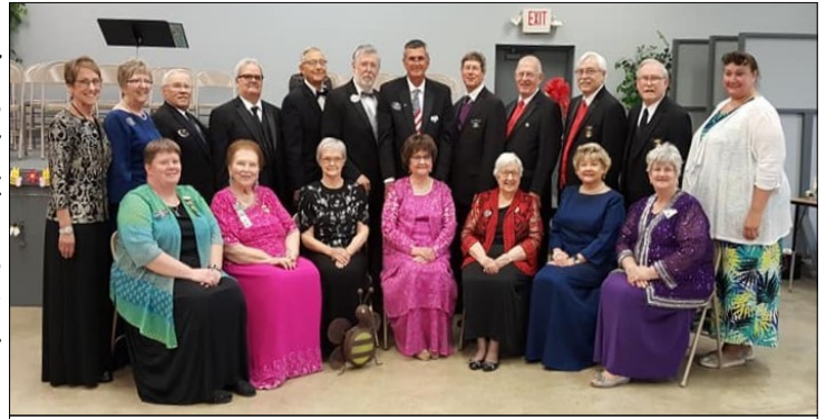
What a grand turnout with all these PGMs and PGPs in attendance. Can you name all 19 of them? And their year?