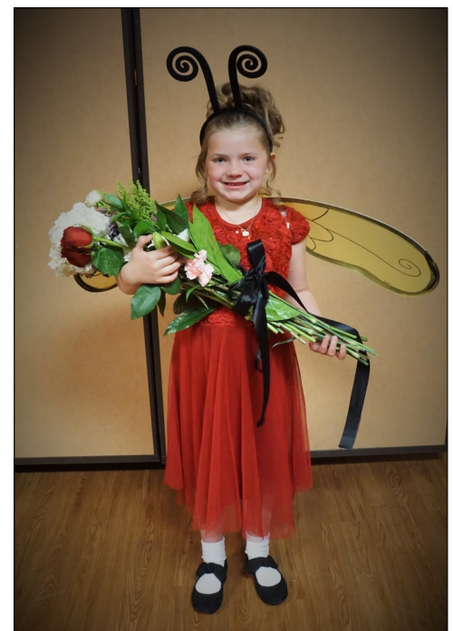
Grand Chapter of Kansas

A big thank you and congratulations to the 2018-2019 Grand Officers for a successful year and Grand Chapter Session. You gave us a great, fun-filled, and service dedicated year!