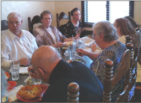
Dodge City members enjoy a delicious meal.

The members of the OES Mystery Dinner Club met recently at El Charro Restaurant for dinner before our meeting at St. Bernard Chapter.