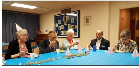
Chapter members donned their party hats to enjoy the delicious ice cream cake following their meeting