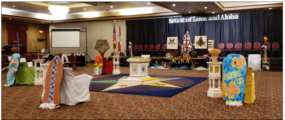
The Grand Chapter room was set up to reflect the theme of the “Spirit of Love and Aloha” Grand year. From torches, to surfboards, flowers and the traditional emblems, all was blended together to set the atmosphere.