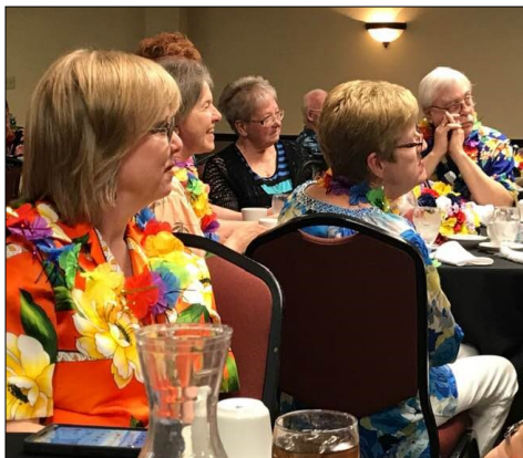
Group meals are a good time to relax a little, eat a little and learn a little.

During introductions, Grand Chapter welcomed a variety of distinguished members and other