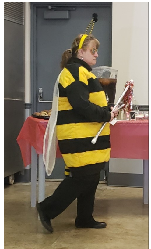
This cheerful bee made her way past the delicious sweets to help escort the WGM on her journey around the Star points.